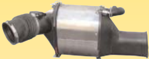
Assembled on OE intake housing