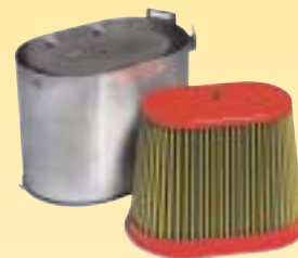
Filter with housing